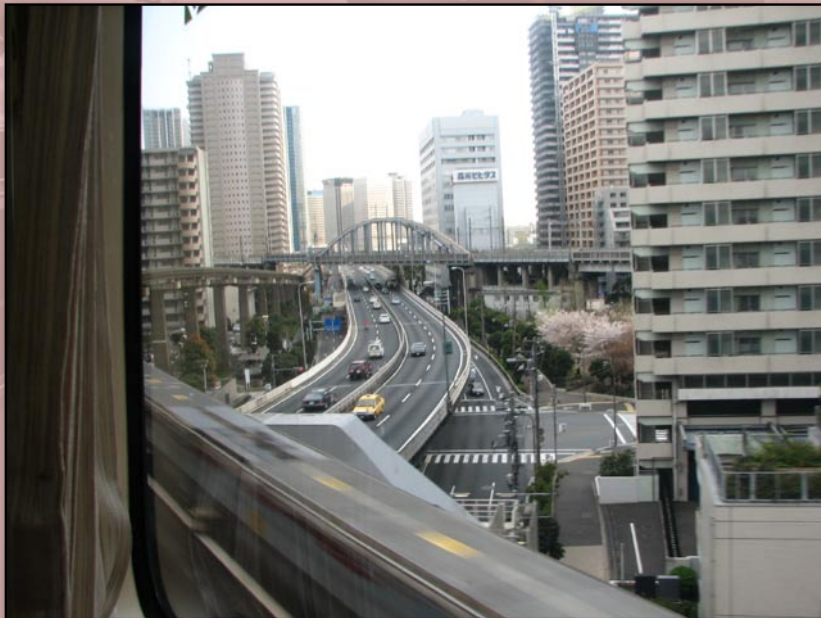
One typical example for one of the Japanese's favourite sports: piling an insane amount of bridges on top of each other.