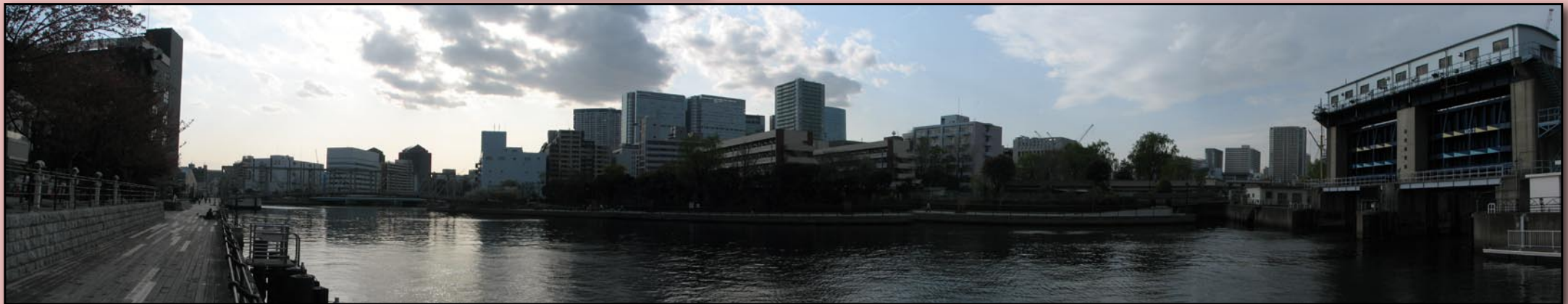
A look at the bridge from the pier