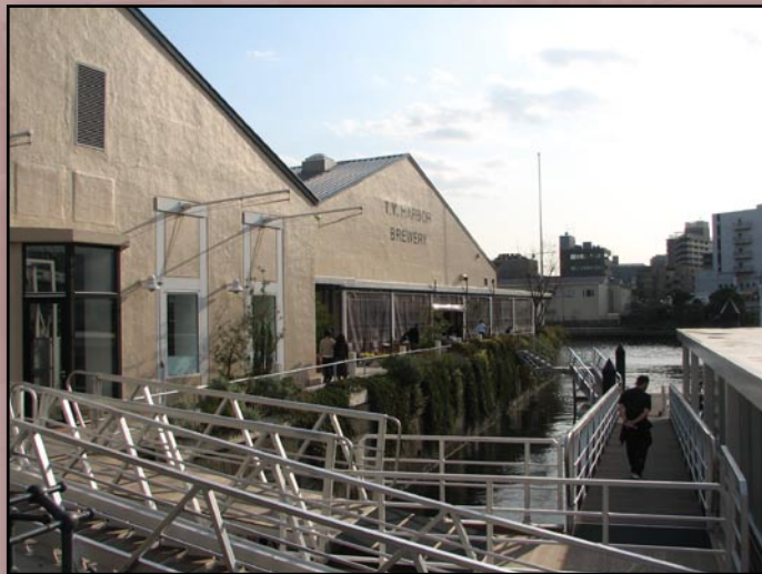
T. Y. Harbor Brewery