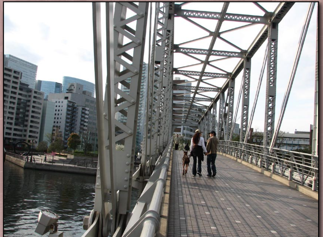
Tennozu Isle Footbridge from the South