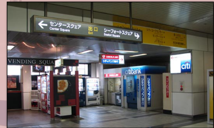
Tennozu Isle station, home of one of a tourist's best friends: A Citybank ATM, which accepts all types of credit cards.