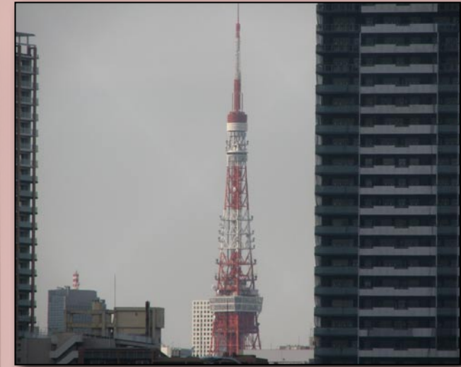
Tokyo Tower, as seen from Tennozu Isle station.