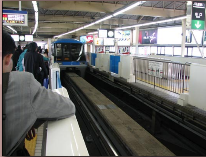
Here comes the Monorail

To get to Tennozu Isle, you first take a JR train to Hamamatsucho station and look for the Tokyo monorail private line. You will have to buy a separate ticket for that line (unless you have a „Holiday Pass“), but its worth it, because a ride on that train is a remarkable experience all by itself, taking you five storeys high through a phantastic city district. It will take you directly to the Tennozu Isle station.